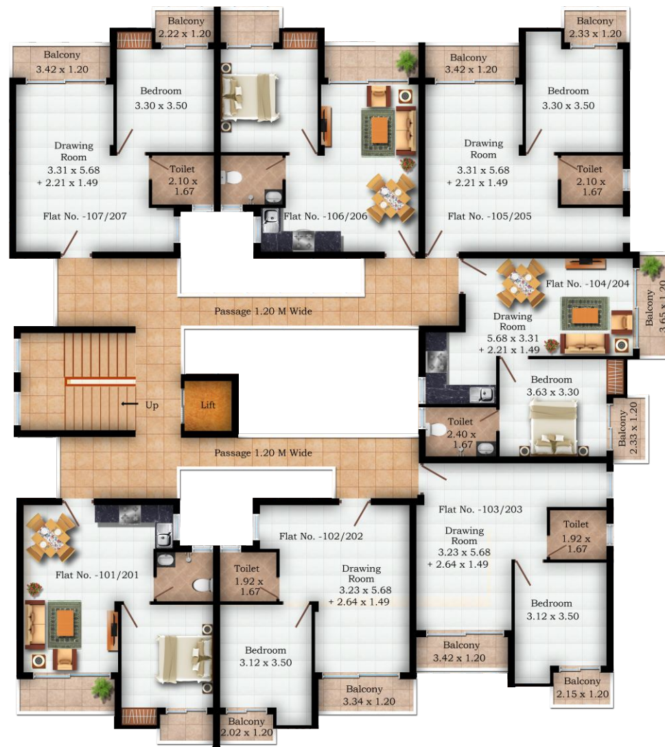
Typical First & Second Floor Plan